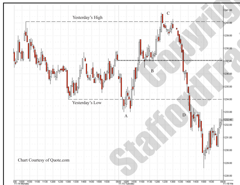
CHART 1. Strong market turning points can sometimes take the form of a double top or double bottom. A, B and C show double tops / bottoms. Point D shows a break of a previous double bottom.